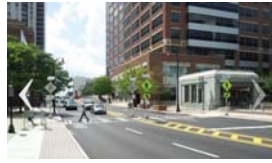
Improved Pedestrian Crossings