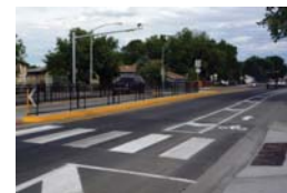
Bike lane buffer - designated space