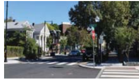
Raised speed hump crosswalks