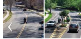
Additional mid-block crossings