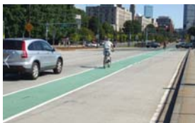
Painted bike lanes