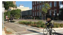
Bike lane buffer - landscaping